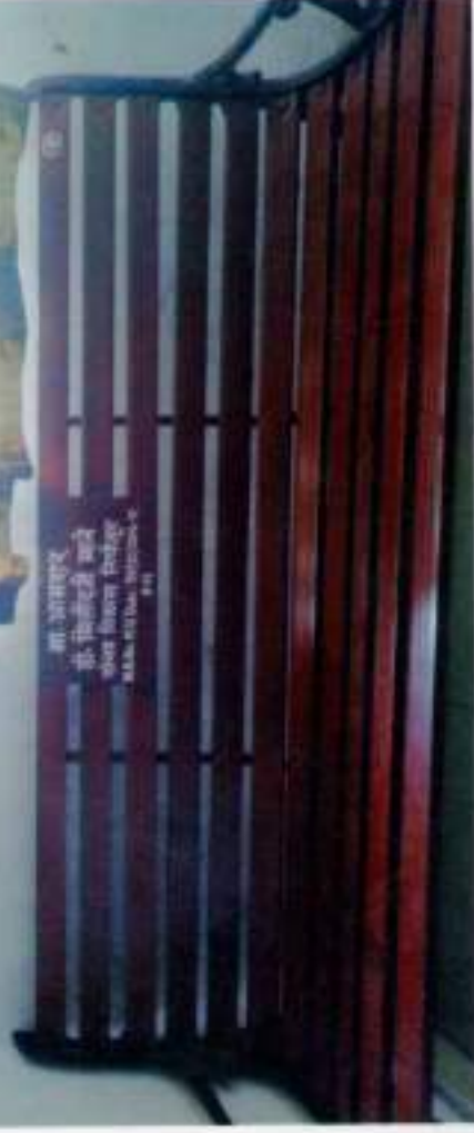
अंधरहीत बुद्ध नगर, नागपुर बीछ विहार, विनीका भावे नगर,