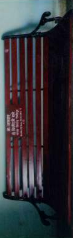
श्रीमदशर्मा नागपुर बीछ विहार, विनीका भावे नगर,