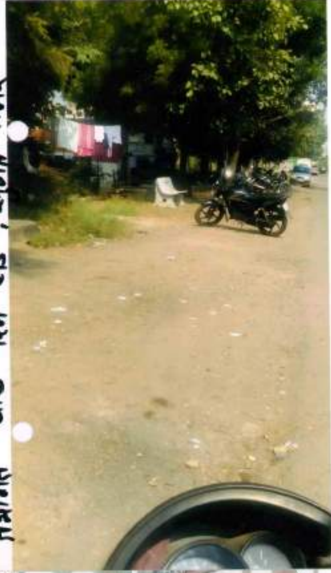
पश्चात्त चौक रिंग रोड, अन्तर्गत नगर