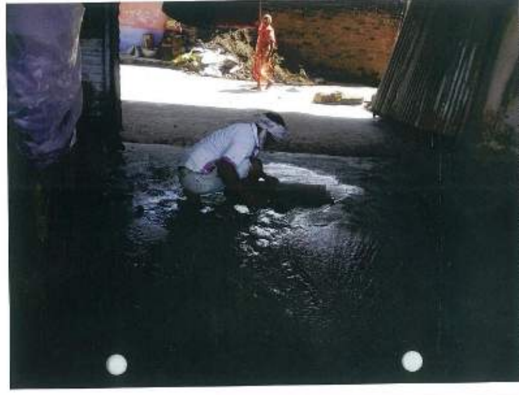
UNDER THAKKARURAM FLYOVER