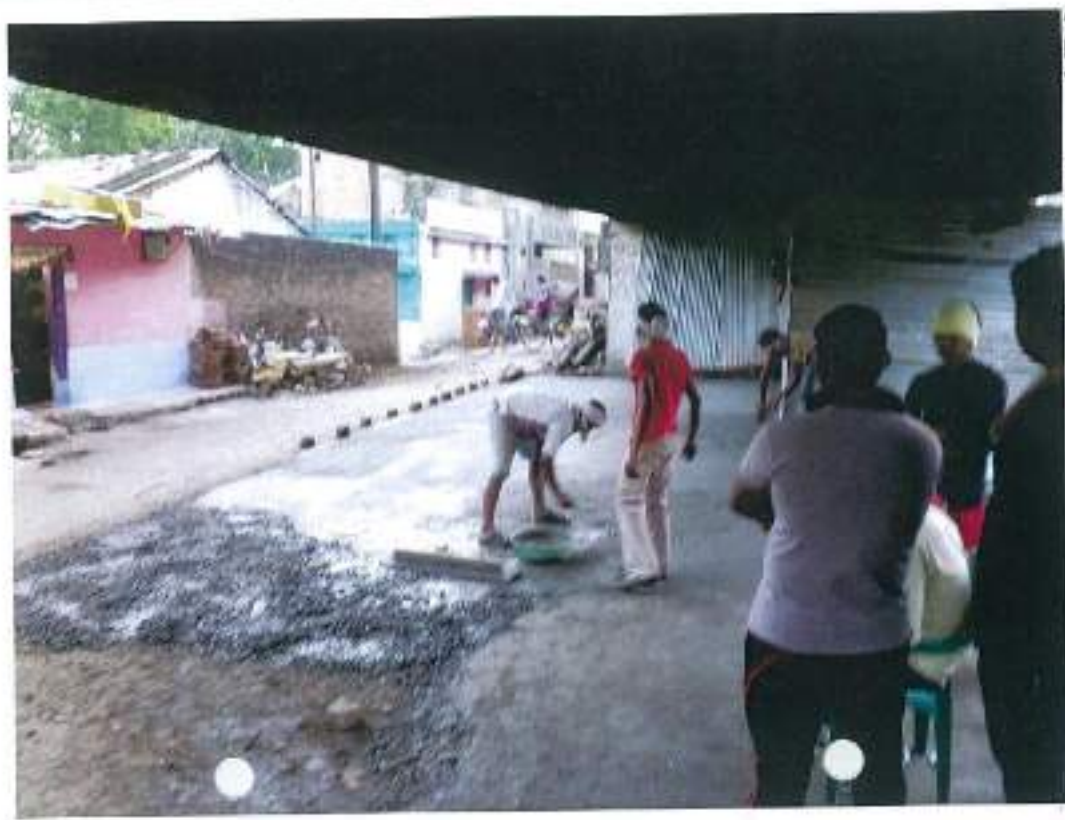
THAKKAR GRAM FLYOVER UNDER THAKKARAM FLYOVER